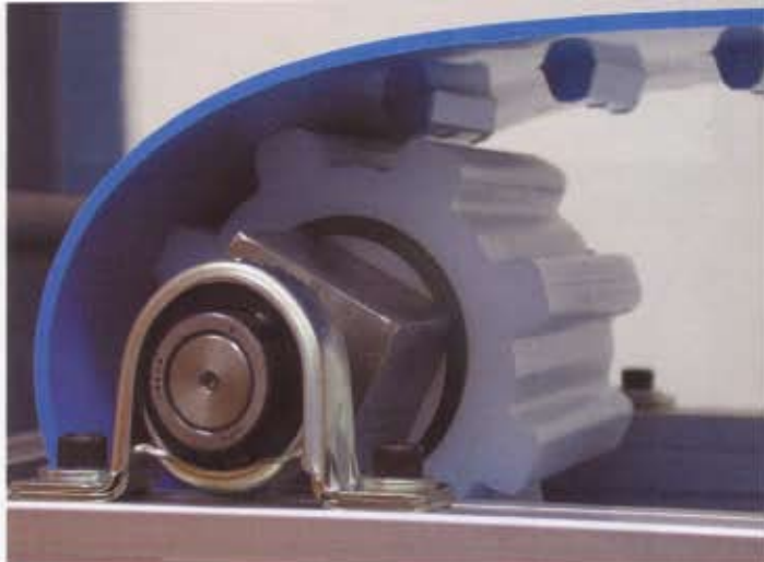
Close-up of the Volta super drive mechanism