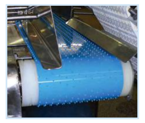
Belt with Spikes