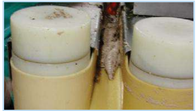
Smooth Belts in Action