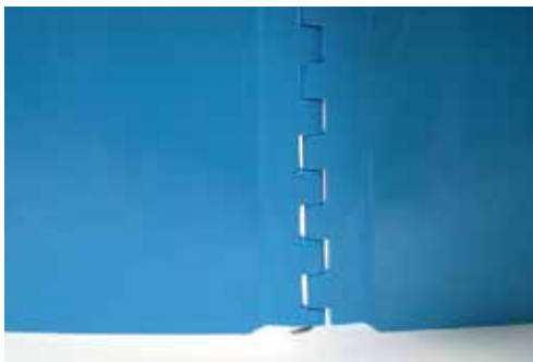
Hinge Lace Welded to Belt

Ensure that the conveyor pulleys fully support at least 80% of the surface when using lace. Hinge Lace is only compatible with Volta 'M' and 'L' Family Flat Belts and with belts of a thickness between 3mm and 5 mm inclusive.