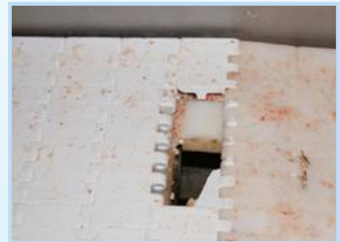
SuperDrive™ A Homogeneous, Positive Drive Conveyor Belt