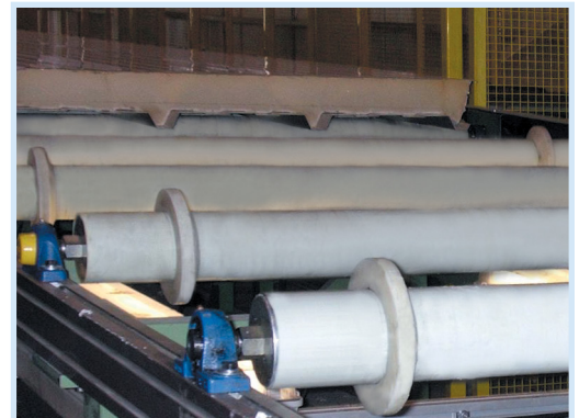
Non-marking surface protects products