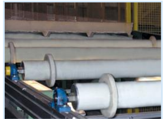
Non-marking surface protects products