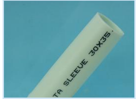
Standard Smooth Surface Sleeves

Note: Contact your local distributor for further details regarding the dimensions and availability of Ribbed Sleeves.