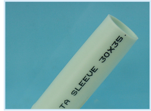
Standard Smooth Surface Sleeves