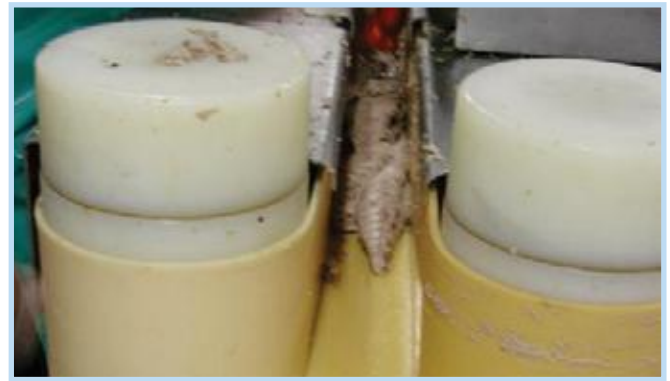
Smooth Belts in Action